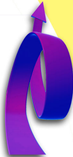
Exhibit Rental Information